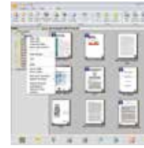
The PaperPort SE14 main screen

- The Professional Choice to Organize and Share Your Documents