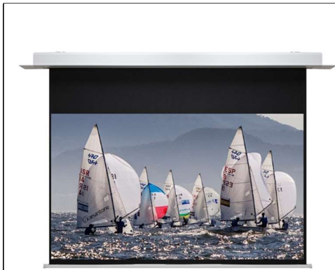
SGIAW260 117" 16:9 format IA Series Commercial Grade In-Ceiling Electric Projector Screen (2.6m * 1.46m)