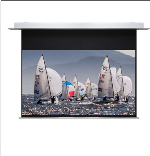
SGIAW240 108" 16:9 format IA Series Commercial Grade In-Ceiling Electric Projector Screen (2.4m * 1.35m)