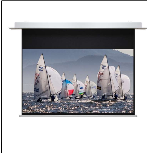
SGIAH300 140" 16:10 format IA Series Commercial Grade In-Ceiling Electric Projector Screen (3.0m * 1.87m)