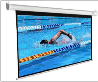
SGHEW400 181" 16:10 format HE Series Large Commercial Grade Electric Projector Screen (4.0m * 2.25m)