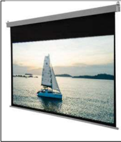
SGHEW260i 117" 16:9 format HE Series Commercial Grade Electric Projector Screen (2.6m * 1.46m)