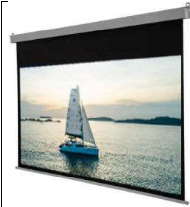
SGHEH280i 130" 16:10 format HE Series Commercial Grade Electric Projector Screen (2.8m * 1.75m)