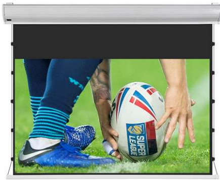
SGETW260 117" 16:9 format ET Series ALR Electric Projector Screen (2.6m * 1.46m)