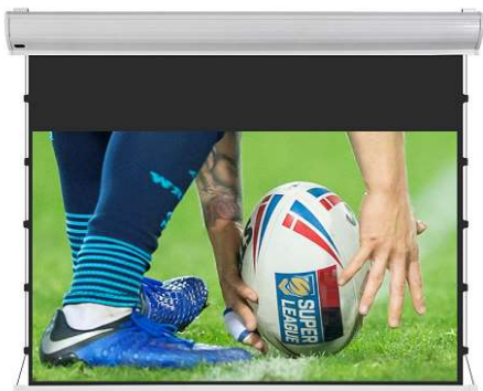
SGETH260 121" 16:10 format ET Series ALR Electric Projector Screen (2.6m * 1.63m)