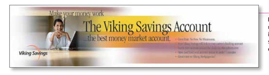
Banners – HD Color on sheets up to 13" x 52" and 360gsm is attention-grabbing – adding spot Clear to call out details even more so!