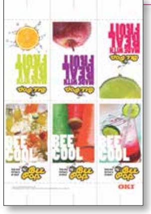
Table Tents – Spot Clear toner makes color even more vibrant on industry-standard substrates