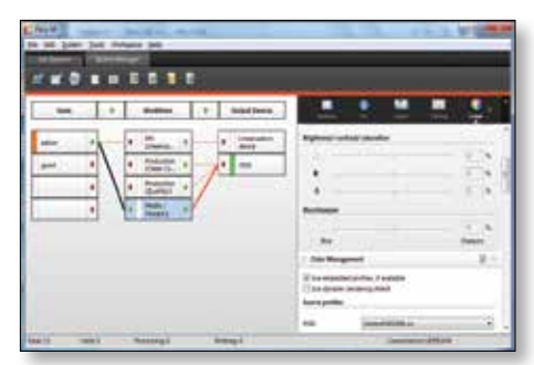
Automated color workflows – save valuable time and reduce operator errors by minimizing manual tuning. Set-up is a breeze, with pre-installed workflows and the availability of downloadable media profiles.

Job management views – for intuitive control and verification of relevant job parameters. Expand job control and reduce print waste with options for creating cutting paths, managing bleeds, and optimizing layouts on sheets.