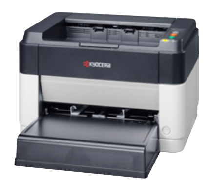
The images displayed in this brochure are for illustrative purposes only, and may include optional extras