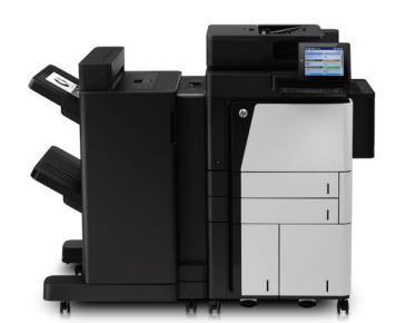
HP LaserJet Enterprise flow M830z (with Near Field Communication & Wireless Direct) MFP