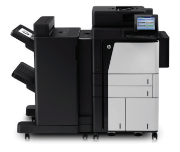
M830z (with Near Field Communication & Wireless Direct)