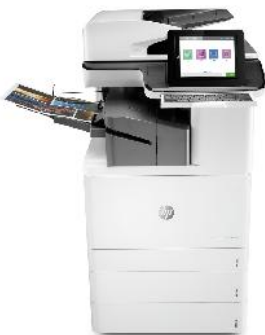
HP Color LaserJet Enterprise Flow MFP M776zs