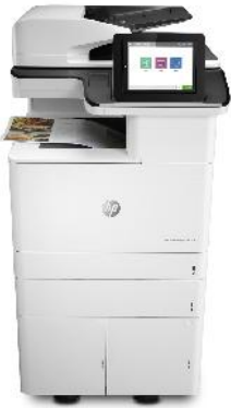
HP Color LaserJet Enterprise MFP M776dn

Expect brilliant color prints from advanced MFPs, equipped with JetIntelligence technology. Offering the world's most secure printing 1 and a wide range of paper handling features, this is printing that helps save time and simplifies workflows.