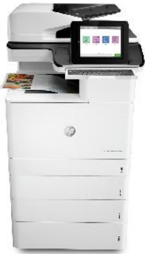
HP Color LaserJet Enterprise Flow MFP M776z