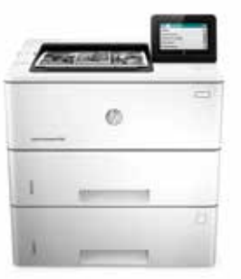
HP LaserJet Enterprise M506x