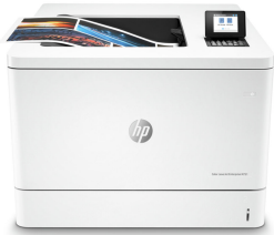
HP Color LaserJet Enterprise M751n

HP LaserJet printers power office productivity with a smart, streamlined design that's reliable and hassle-free. Count on premium quality, maximum uptime, and the strongest security 1 —all intended to drive successful organizations forward.