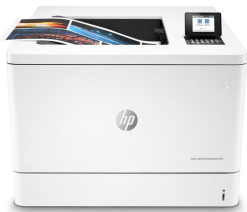
HP Color LaserJet Enterprise M751dn