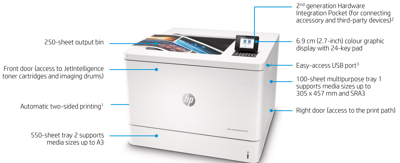
HP Color LaserJet Enterprise M751 dn