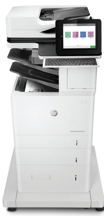
HP LaserJet Enterprise Flow MFP M633z