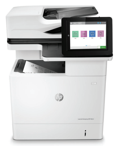
HP LaserJet Enterprise MFP

This HP LaserJet MFP with JetIntelligence combines exceptional performance and energy efficiency with professional-quality documents right when you need them—all while protecting your network from attacks with the industry's deepest security.