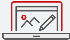
DIGITAL PHOTO PROFESSIONAL