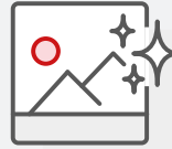
PROFESSIONAL PRINT & LAYOUT