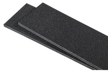
1510TPDIV Extra TrekPak Dividers