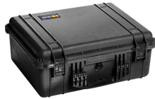
1550NF No Foam