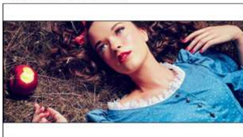
2.35:1 movie on a 16:9 screen