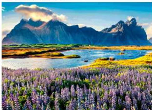
8 bit image processing