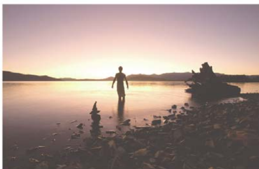
Lower contrast ratio

Enjoy bright, vibrant pictures as well as excellent shadow detail, so you can bring your favourite movies to life.